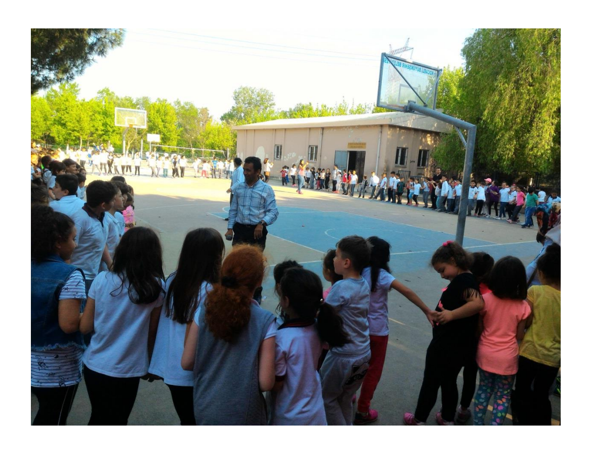
Everything is for Children!